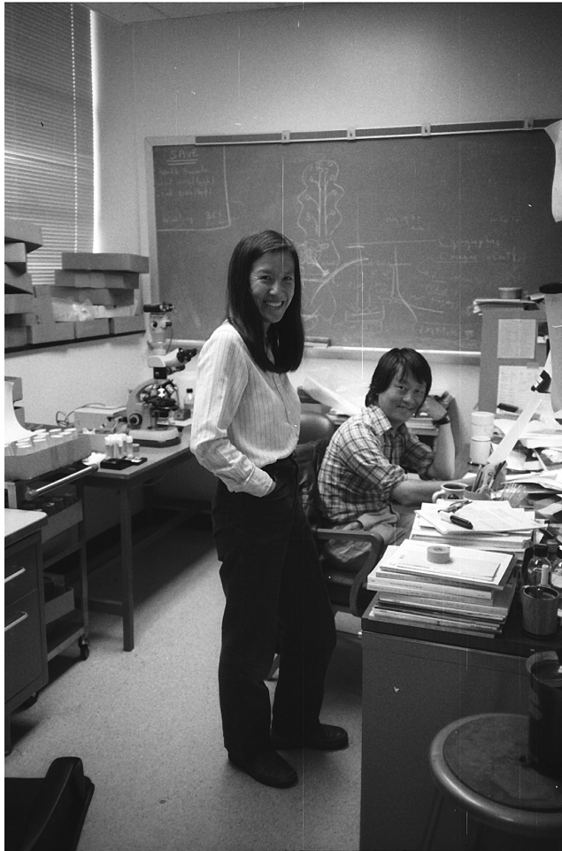
Fig. 4. The shared office of the authors' lab at UCSF in the early 1980s.

In late June 1979, we drove across the country during the height of the oil crisis, with our daughter a toddler not quite two years old, to start our lab at UCSF on July 1. It took us a couple of months to set up our little lab on the eighth floor of Health Sciences East (HSE) on the Parnassus campus (see Figure 4) and then we started doing experiments.