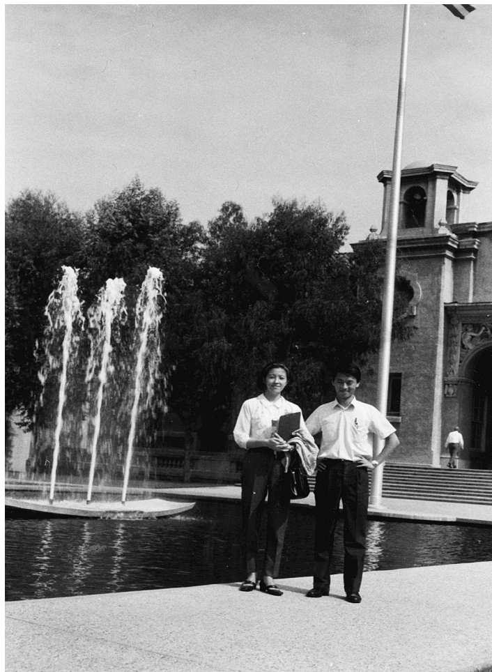
Fig. 1. Shortly after arrival at Caltech, 1968.